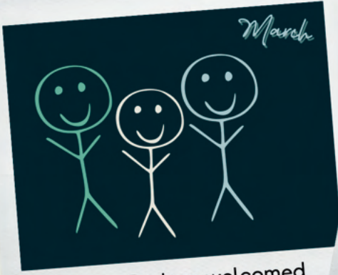
Cancer Bridges welcomed members back into the building for in-person programs!