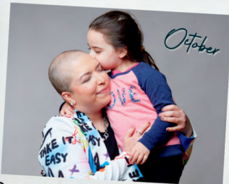
Cancer Bridges & Sabika Jewelry partnered for the Celebrate Your Sparkle event.