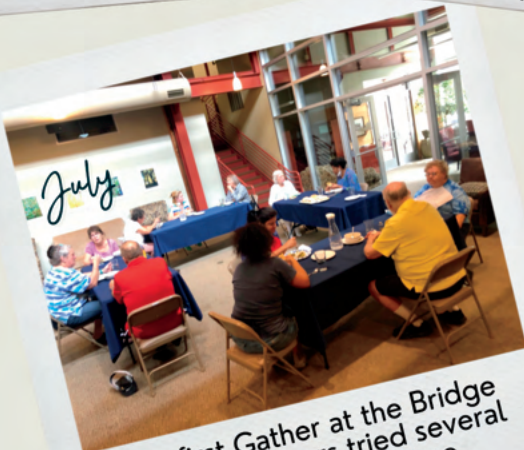
Our first Gather at the Bridge where members tried several programs at one time.