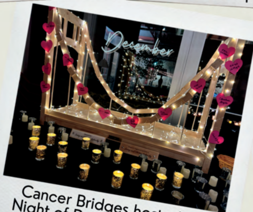
Cancer Bridges hosted a Night of Remembrance for loved ones lost to cancer.