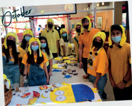
Boo Bash returned to Cancer Bridges for a spooktacular good day!