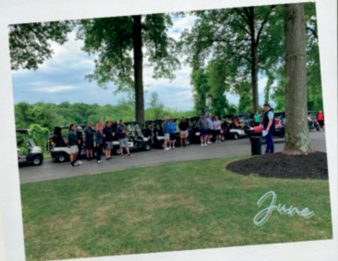
Cancer Bridges hosted our Annual Golf Classic.