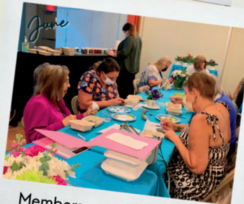
Members participated in a Metastatic Breast Cancer support program.