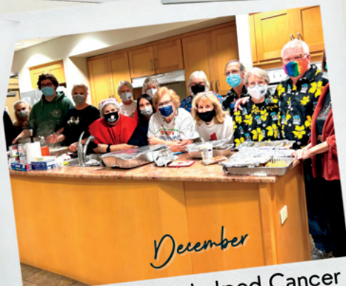
Steel City Fins helped Cancer Bridges celebrate with our Holiday Extravaganza!