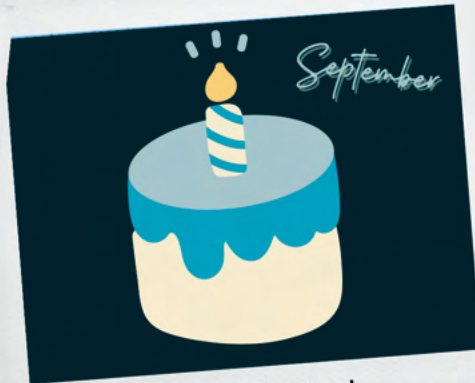
We celebrated our 1st birthday as a merged organization!