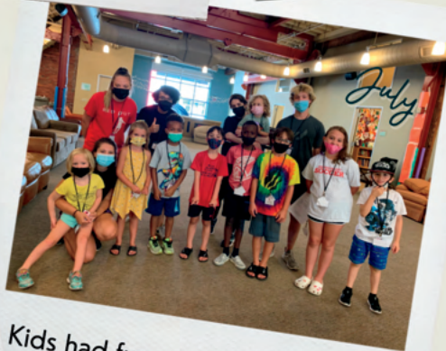
Kids had fun and found support at Camp Clubhouse 2022!