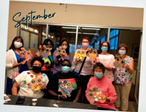
Members participated in beautiful art therapy wellness activities.