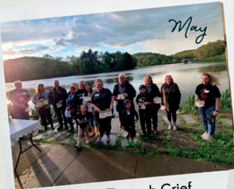
Moving Through Grief concluded with a Celebration of Light at North Park Lake.