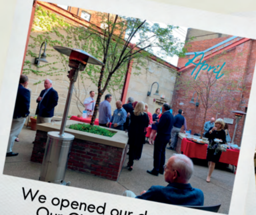
We opened our doors for Our Glass is Half Full wine tasting fundraiser.