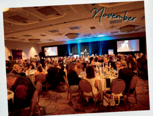
We honored our Luminaries at the annual Light Up Gala.