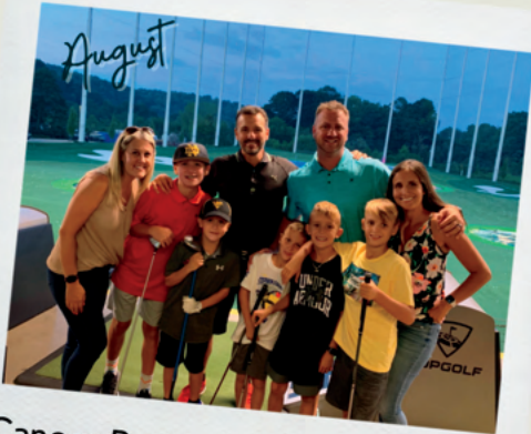
Cancer Bridges supporters had a tee-rific time at Topgolf!